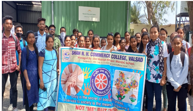
FIELD TRIP - VIDHISHA